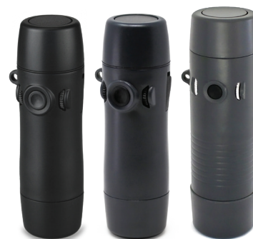
Provox® TruTone EMOTE®, Provox® TruTone Plus® and Provox® SolaTone Plus™

** High-capacity battery for legacy TruTone Plus